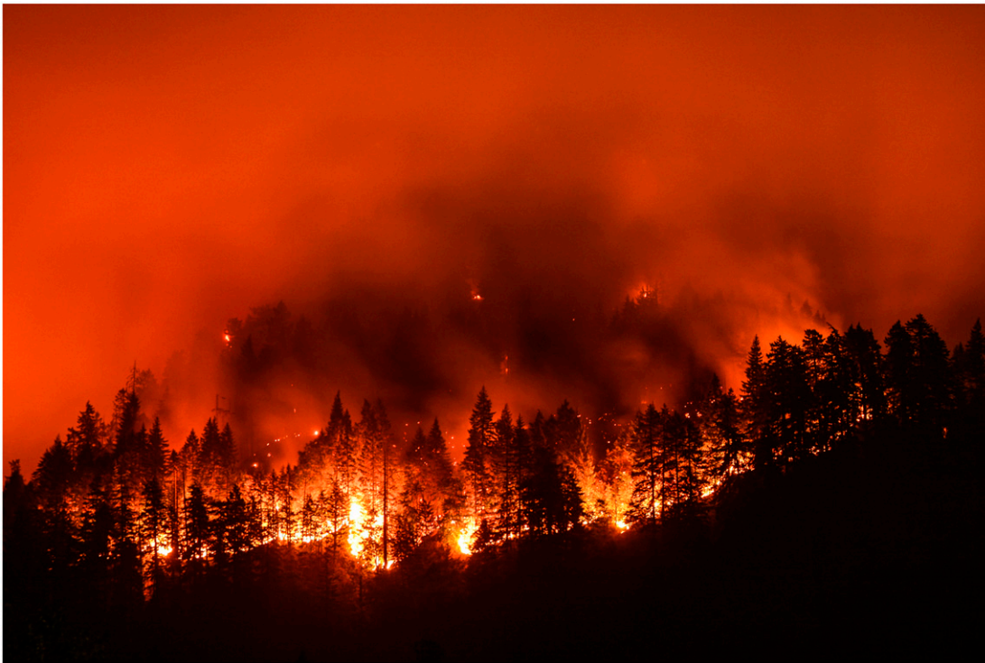
Fig. 1. Carbon-management policies would do well to use disturbance ecology to factor in tree mortality risk. For wildfire and other impactful disturbances, researchers now have the capability to incorporate these risks into policy mechanisms that enhance forest carbon storage. Doing so would substantially improve global forest carbon policies aimed at climate change mitigation.

What has been missing is the explicit use of disturbance ecology to factor in tree mortality risk. For wildfire and other impactful disturbances, our understanding is now sufficient to incorporate these risks into policy mechanisms that enhance forest carbon storage. Doing so would substantially improve global forest carbon policies aimed at climate-change mitigation.